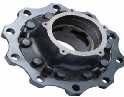
930286004 WHEEL HUB