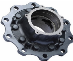
930286005 WHEEL HUB