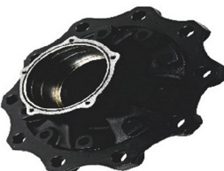
930286006 WHEEL HUB