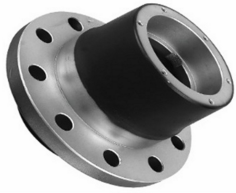
930286001 WHEEL HUB