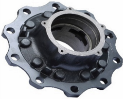
930286003 WHEEL HUB