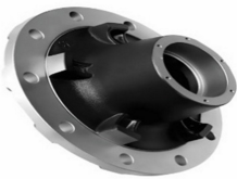
930286002 WHEEL HUB